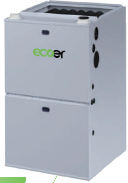
/// Ecoer 96% AFUE Furnace