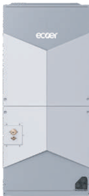
TDi Pro 2 Air Handler