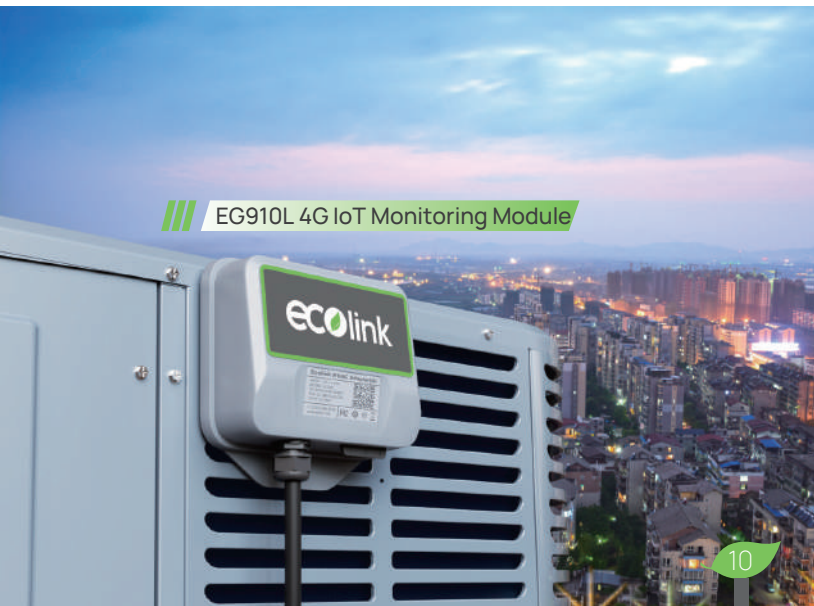
EG910L 4G IoT Monitoring Module