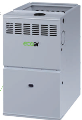
/// Ecoer 80% AFUE Furnace