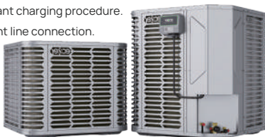
TDi Pro 2