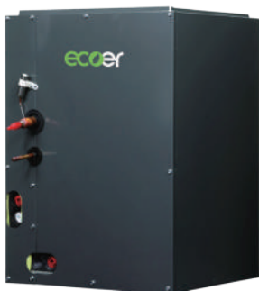
/// Ecoer EBCT Series A-coil