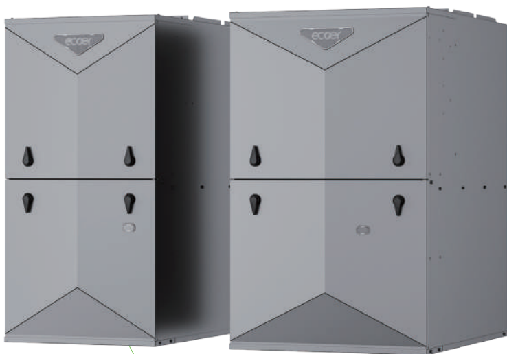
/// Ecoer 98% AFUE Furnace