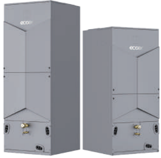
/// New TDi 2 AirHandler