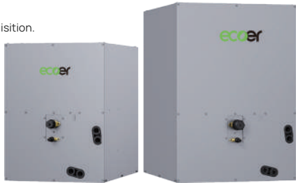
/// NEW TDi 2 A-Coil