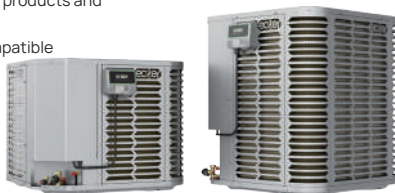
TDi Select 2