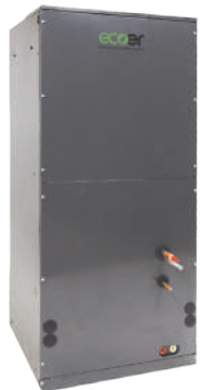
/// Ecoer 120V Air Handler